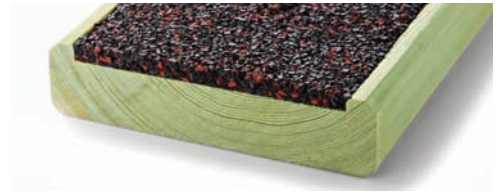
WalkSure cross section